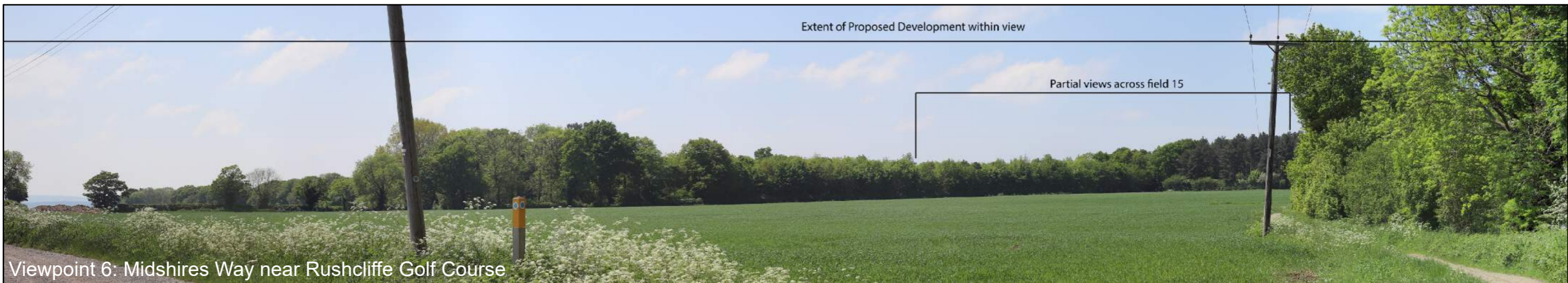
Viewpoint 6: Midshires Way near Rushcliffe Golf Course