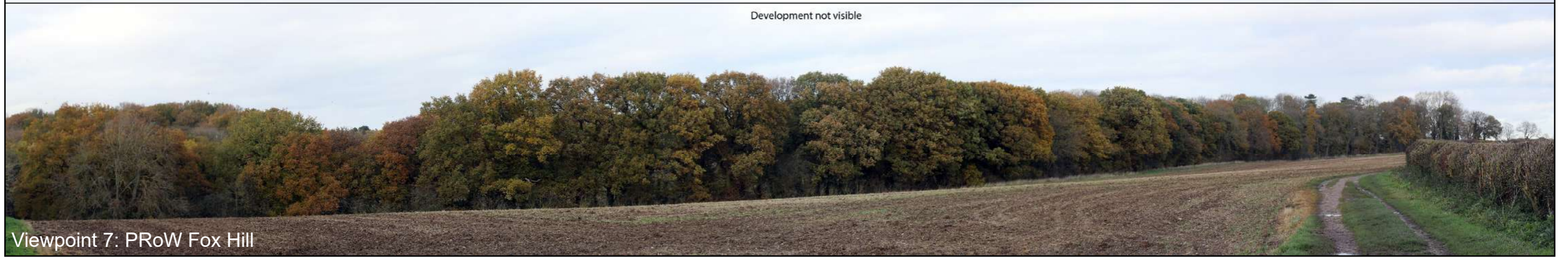
Viewpoint 7: PRow Fox Hill