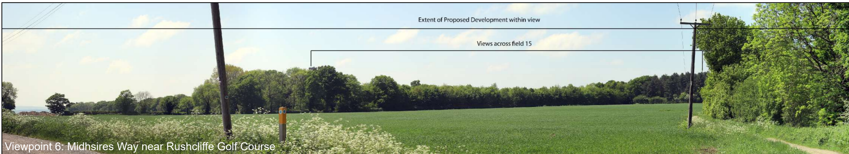
Viewpoint 6: Midsires Way near Rushcliffe Golf Course