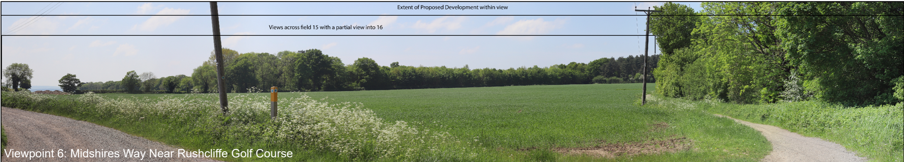
Viewpoint 6: Midshires Way Near Rushcliffe Golf Course

Views across field 15 with a partial view into 16