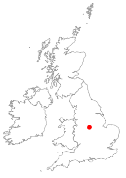
SITE LOCATION - NOT TO SCALE